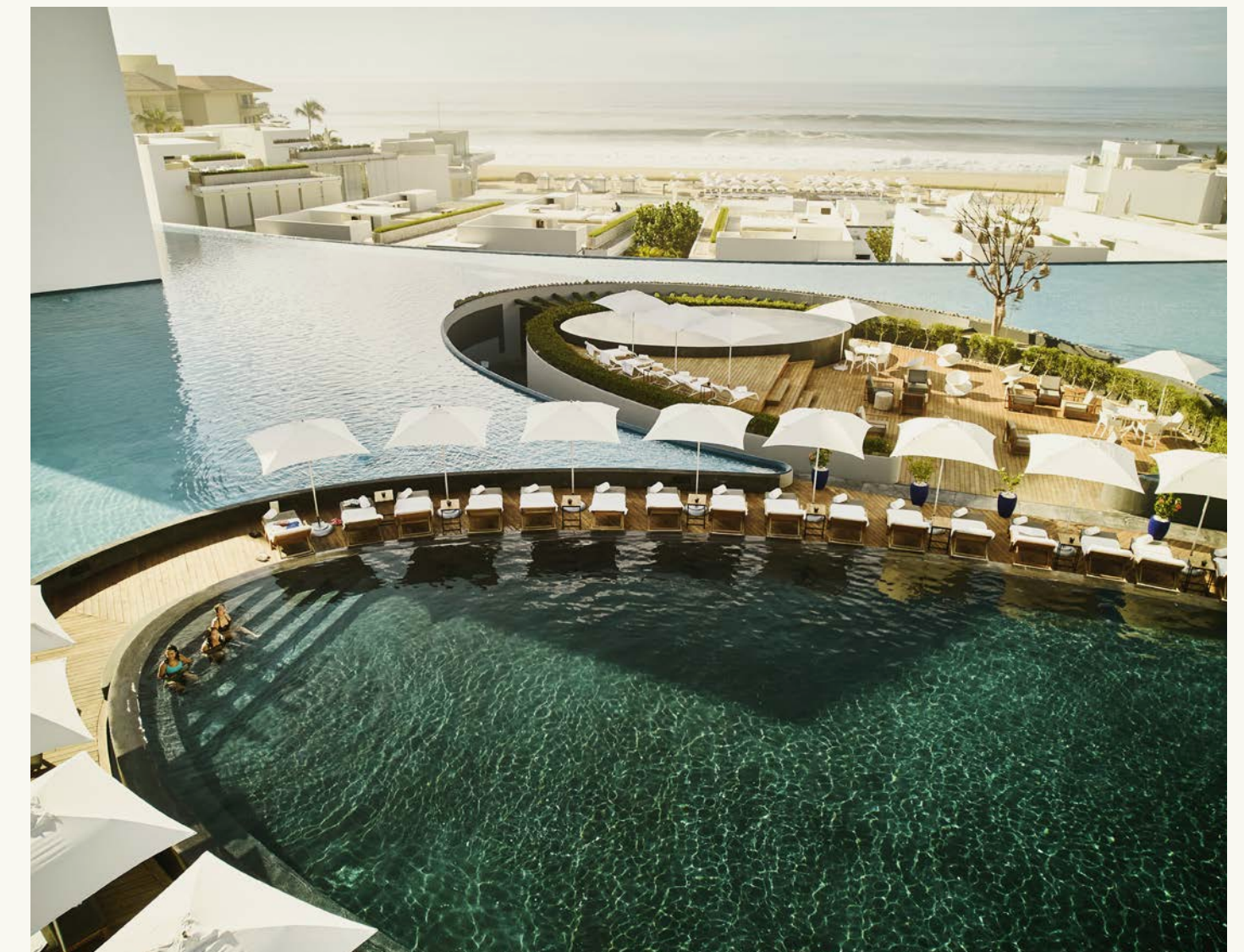
Viceroy Los Cabos