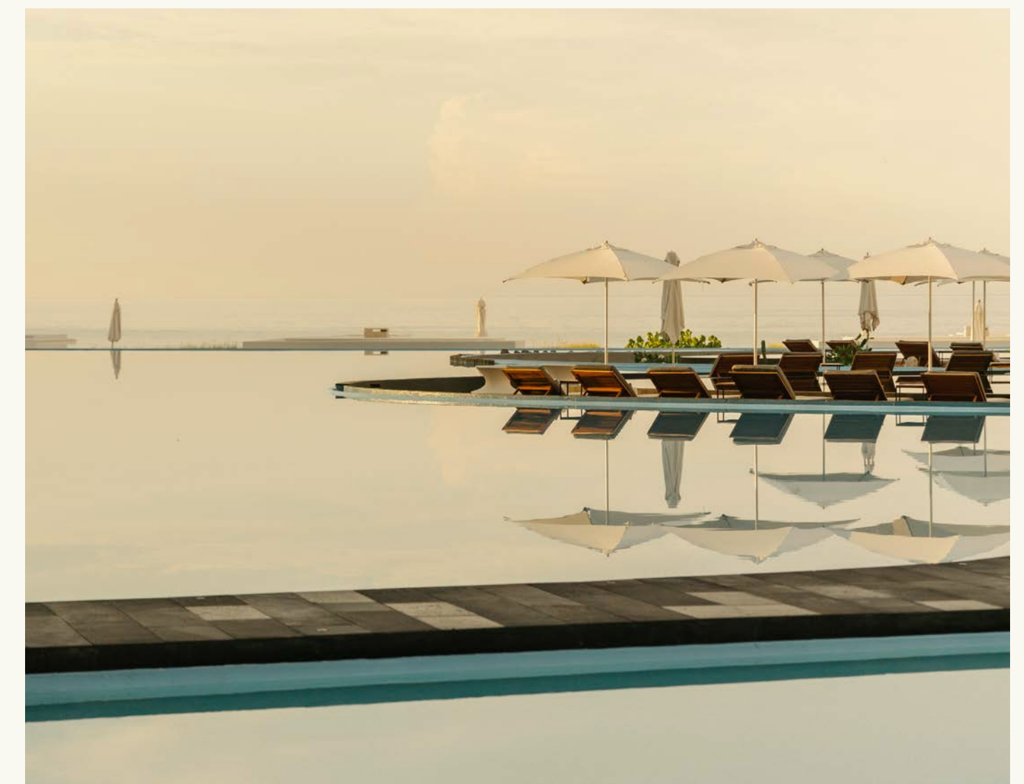
Viceroy Los Cabos