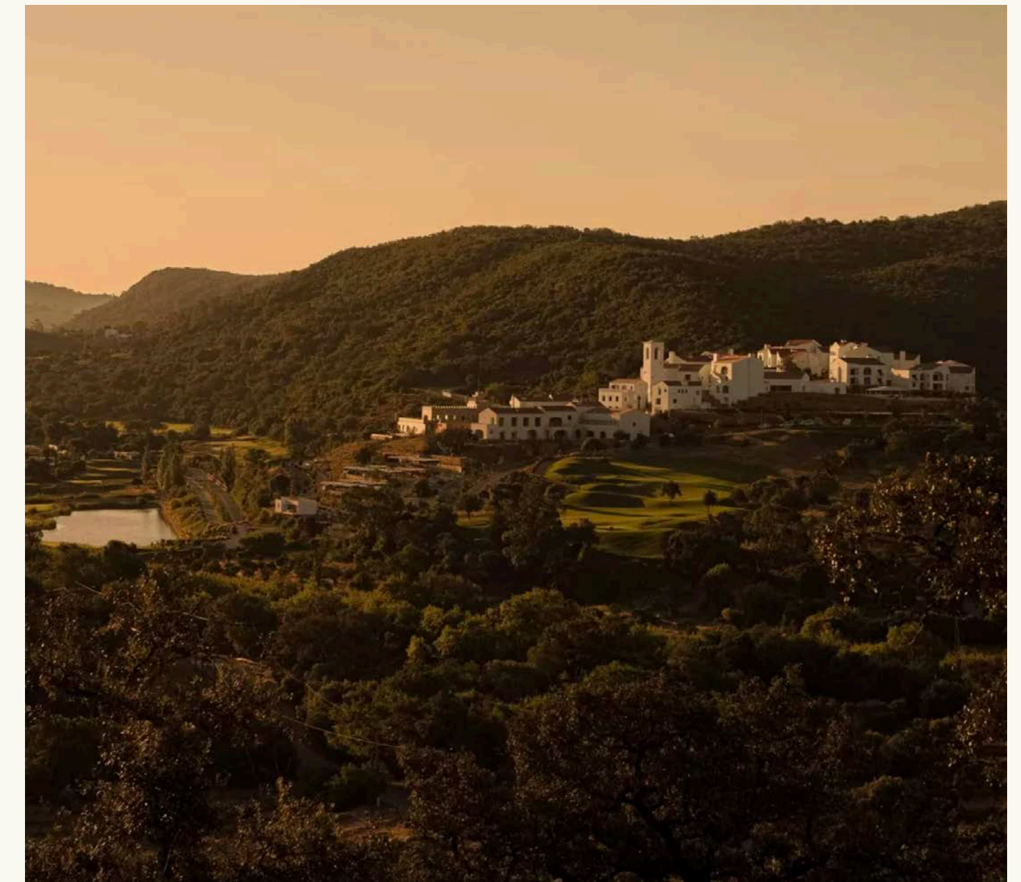
Viceroy at Ombria Algarve