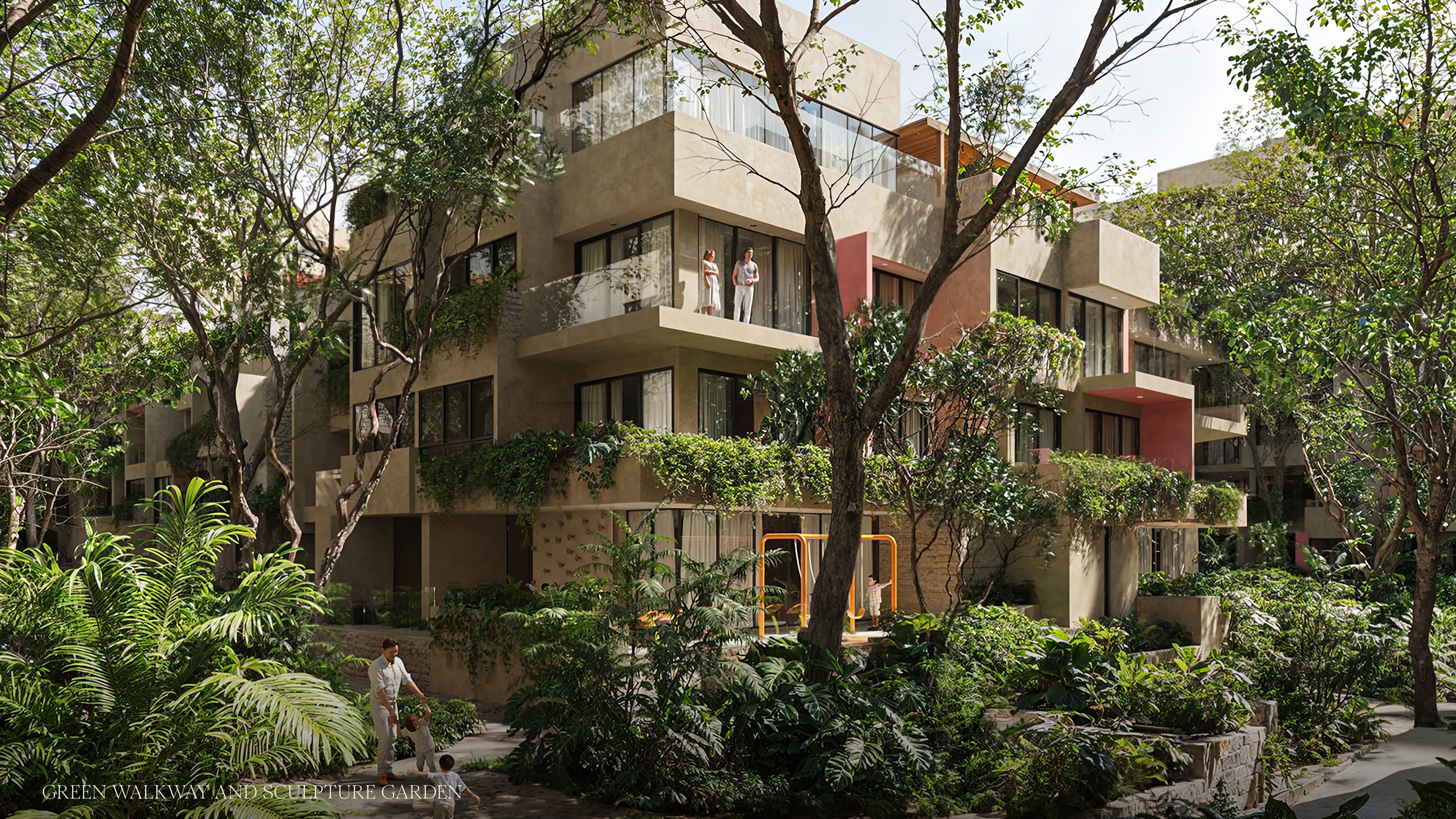
GREEN WALKWAY AND SCULPTURE GARDEN