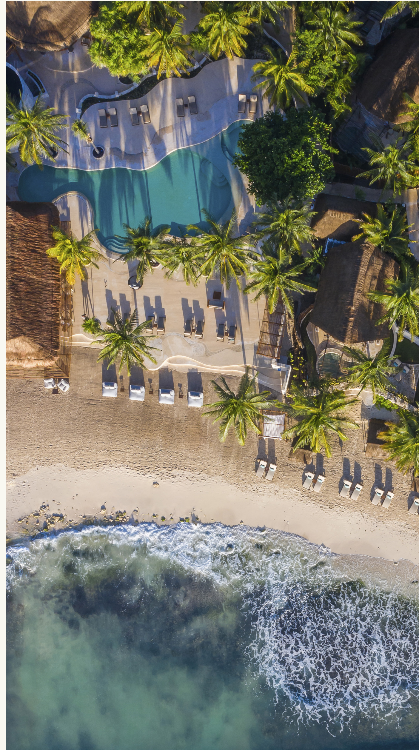
Viceroy Riviera Maya